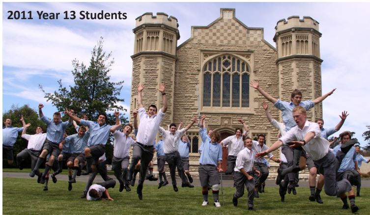
2011 Year 13 Students

PLEASE REMEMBER WHEN YOU SHOP AT W.B.H.S UNIFORM SHOP THAT ALL PROFITS ARE DONATED BACK TO THE SCHOOL